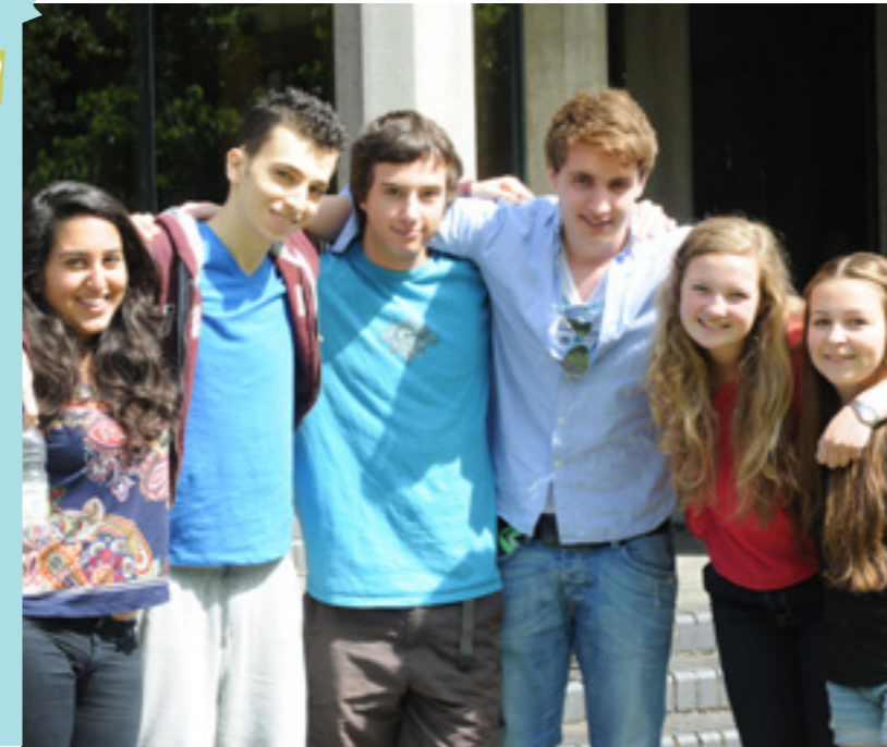
UBC's name and logo is used with permission from The University of British Columbia. Oxford Study Courses Ltd. has no affiliation with UBC and is solely responsible for the quality, suitability, and delivery of OSC IB Summer Courses.